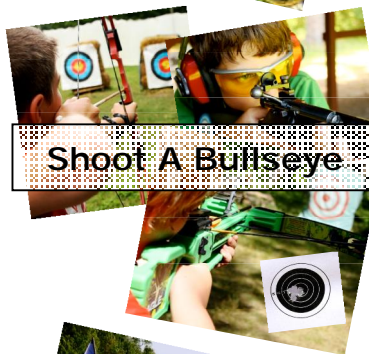
Shoot A Bullseye