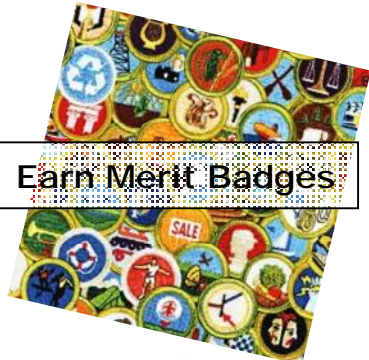
Earn Merit Badges

An opportunity to attend camp without your troop